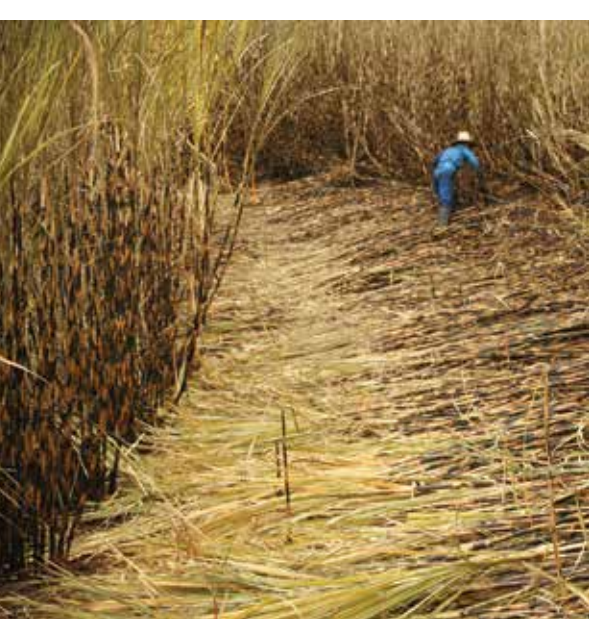
Cane cutter Brazil

The most important environmental criterion for both REDD+ performance and roundtable certification is deforestation. In REDD+, this is framed as reductions of carbon emissions from deforestation and forest degradation. In roundtables, there are restrictions on the clearing of native forests (and native ecosystems generally) and of high conservation value forests